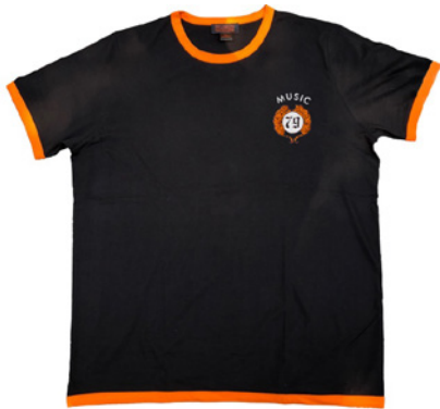
BLACK TEE-SHIRT MUSIC