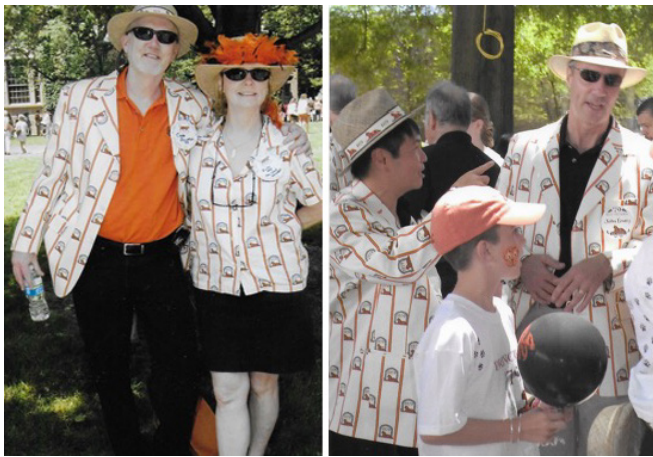
25 th Reunion Jacket